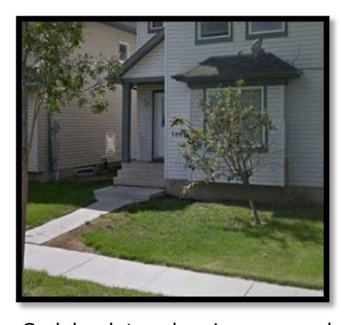
Sod dead, tree leaning over and needs to be staked