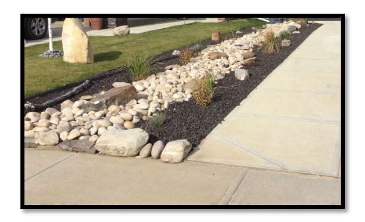
Very little sense of green, more shrubbery needed