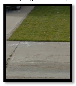
This would pass inspection

What if my landscaping dies or becomes unhealthy before the inspection takes place? Only healthy plant material will pass inspection. Dead or dying trees or shrubs will not pass. Sod that is patchy or dying will not pass.