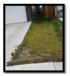
This would not pass inspection