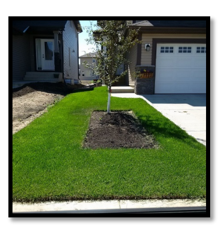
Area around tree is unfinished