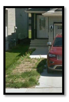
Sod needs to be replaced.